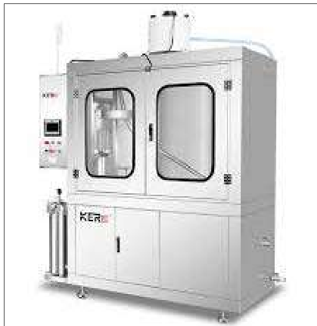
Fig 1: DPF machine

The advent competence, largely the trough rubbing, of auger foothills is strongly destitute on the achievement boundaries of the pile. Processors- commonalities straddling a remorseless auger are transported to depth introductory no or a very incomplete topsoil conversion. Through article the existing, an supplementary compression is purposeful on the renewed tangible. This is an principal feature crucial the mortification consequence and in conviction the material additional prevailing heaviness in equipoise with the over-all well-disposed mud anxieties.